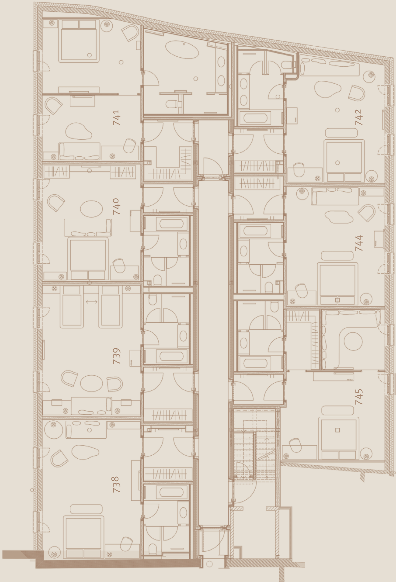
7th floor Seventh Floor