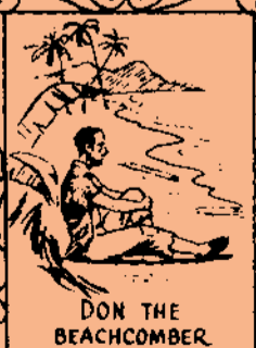
DON THE BEACHCOMBER